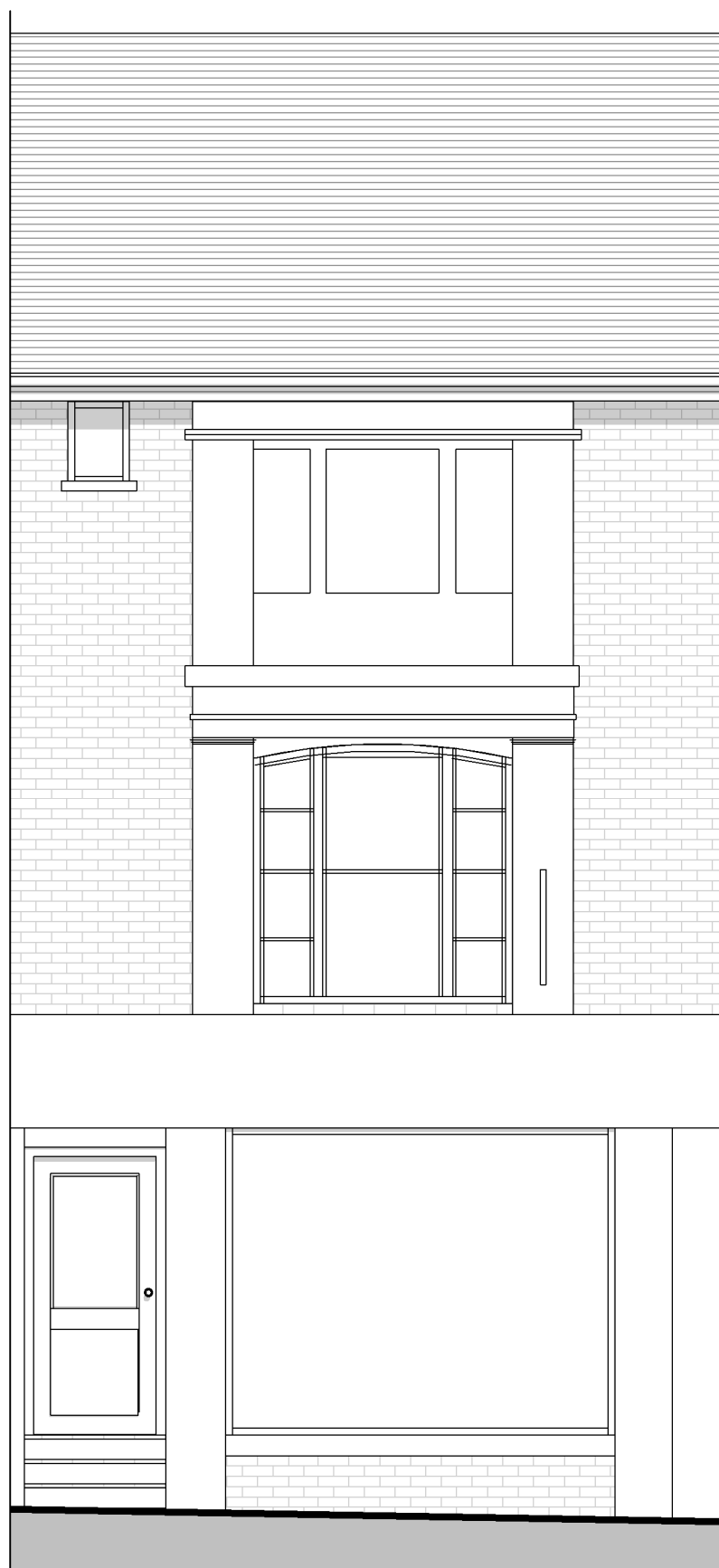
South Elevation as Existing 1:50