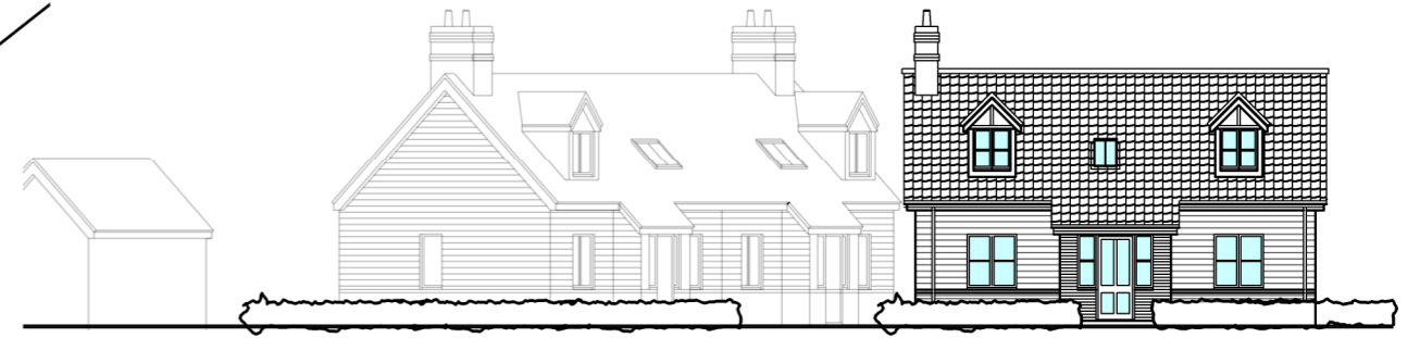
indicative street scene 1:200