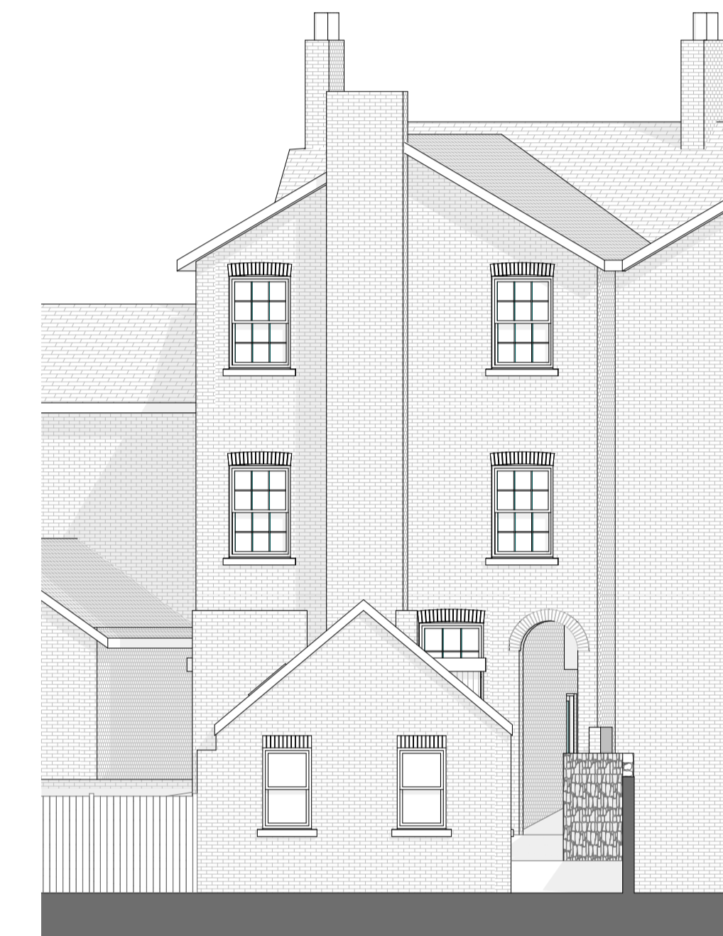
1:100 E4 Rear Elevation