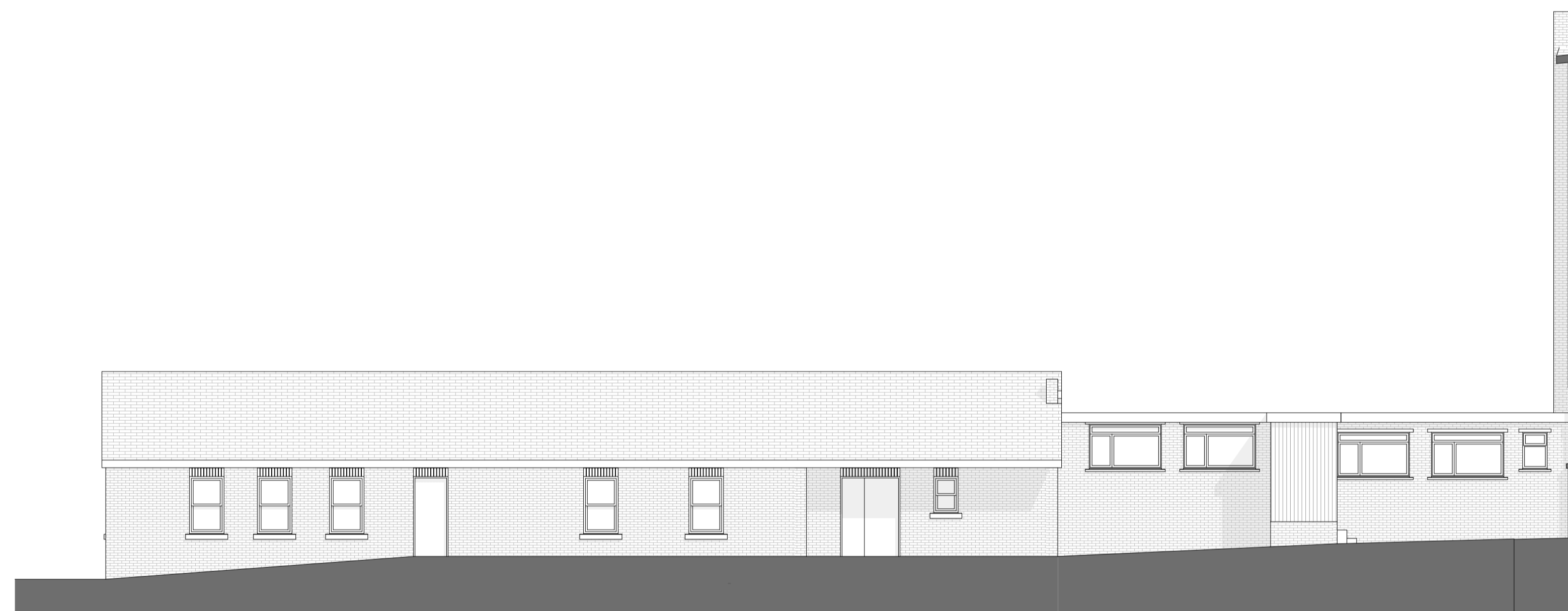
1:100 E3 Side Elevation