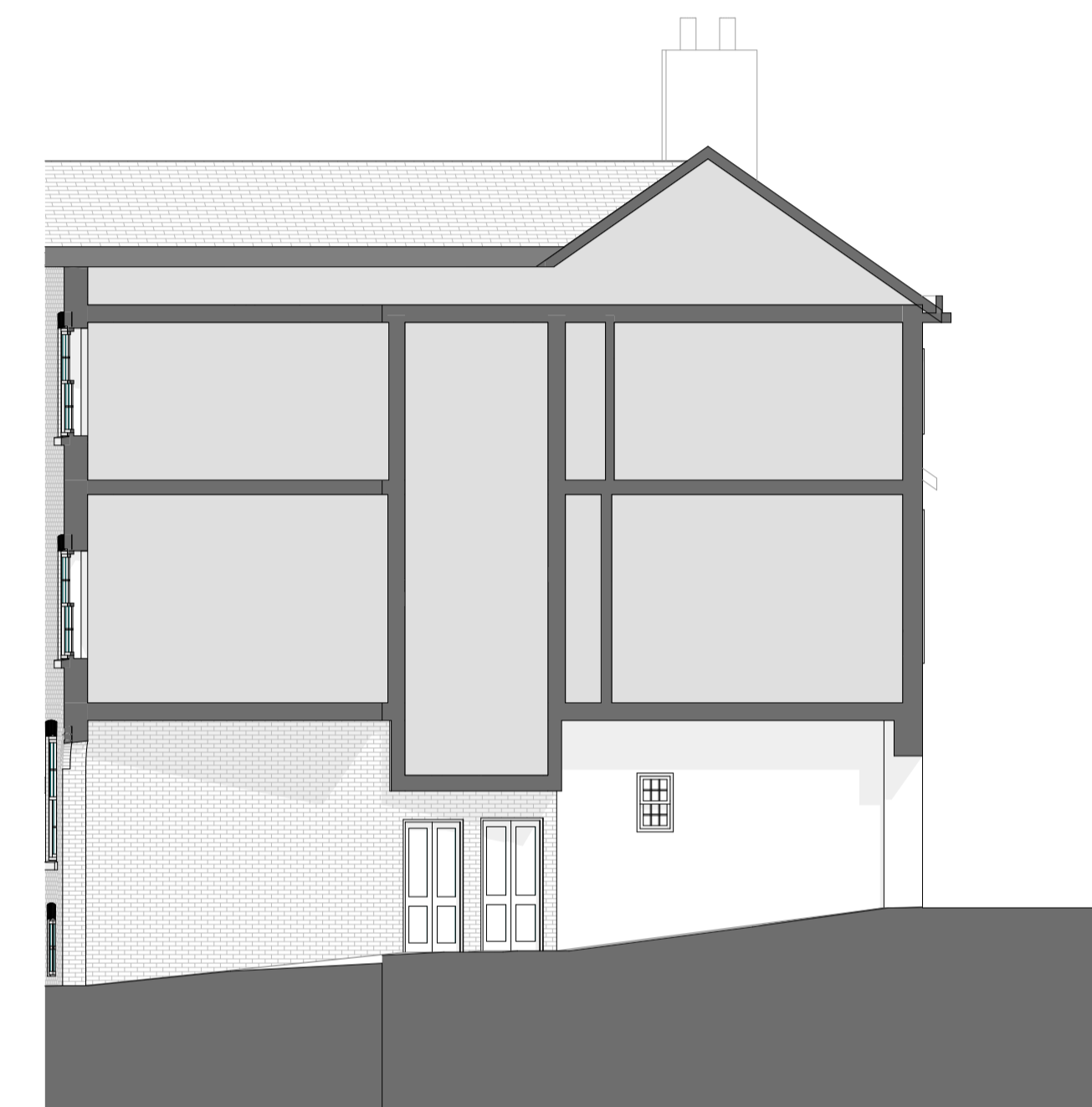
1:100 E2 Side Elevation