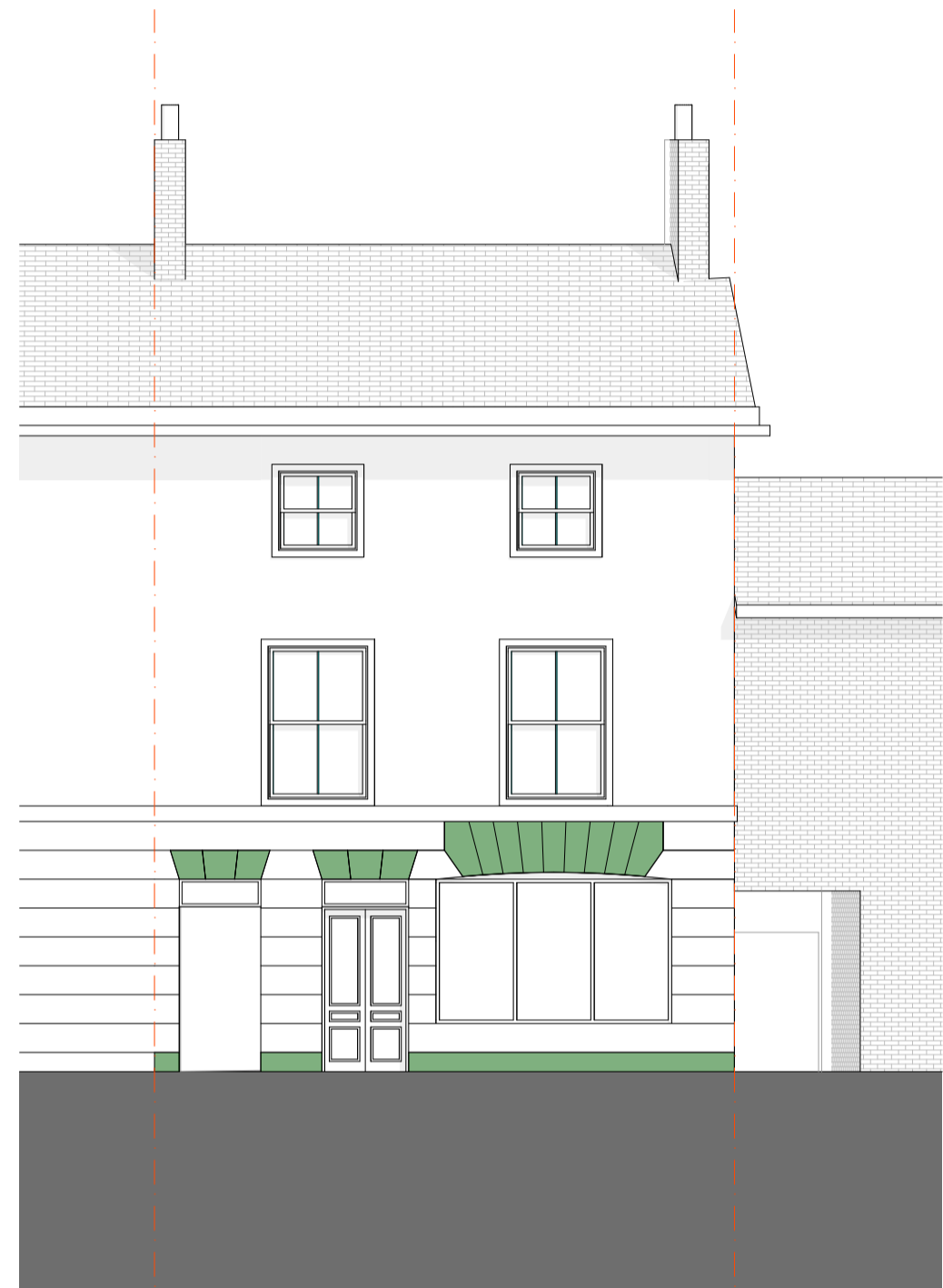
1:100 E1 Front Elevation