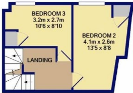
1ST FLOOR APPROX. FLOOR AREA 22.6 SQ.M. (243 SQ.FT.)