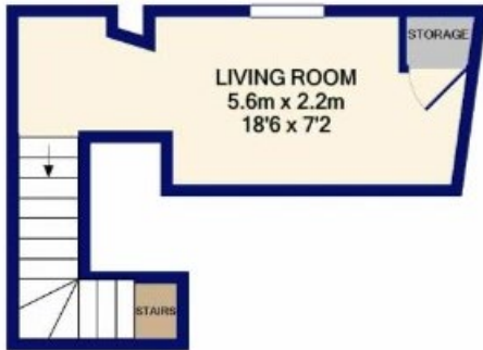
BASEMENT LEVEL APPROX. FLOOR AREA 14.1 SQ.M. (152 SQ.FT.)