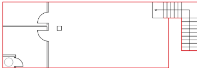
FIRST FLOOR LAYOUT 1:50