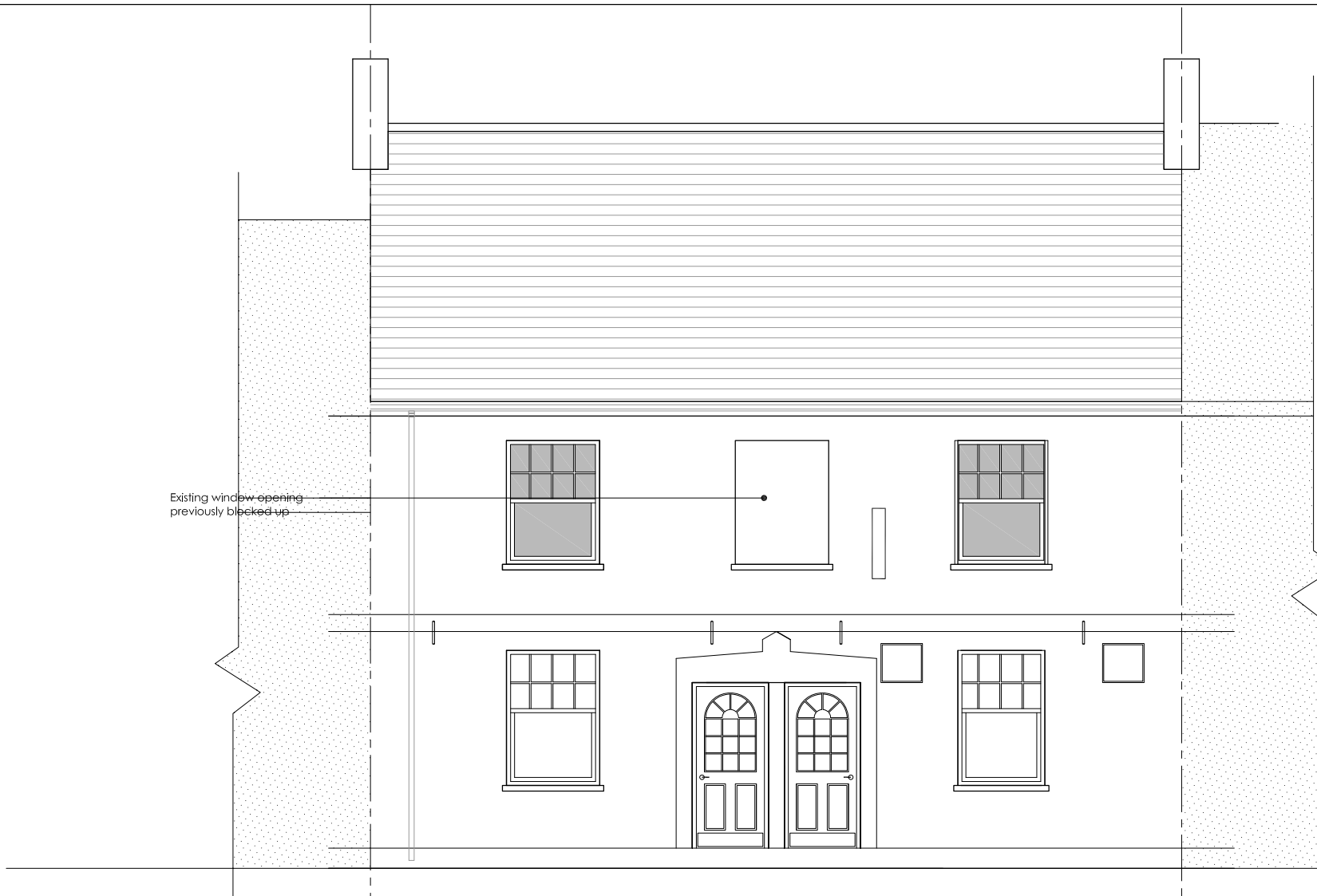
01 EXISTING FRONT ELEVATION SCALE: 1:75