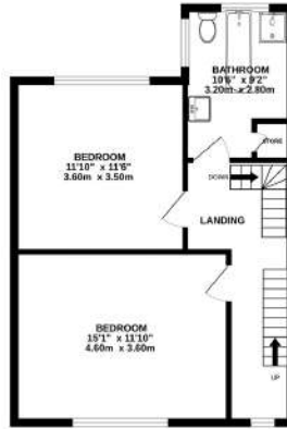
1ST FLOOR 485 sq.ft. (45.2 sq.m.) approx.