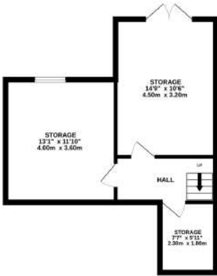
BASEMENT 410 sq.ft. (38.1 sq.m.) approx.