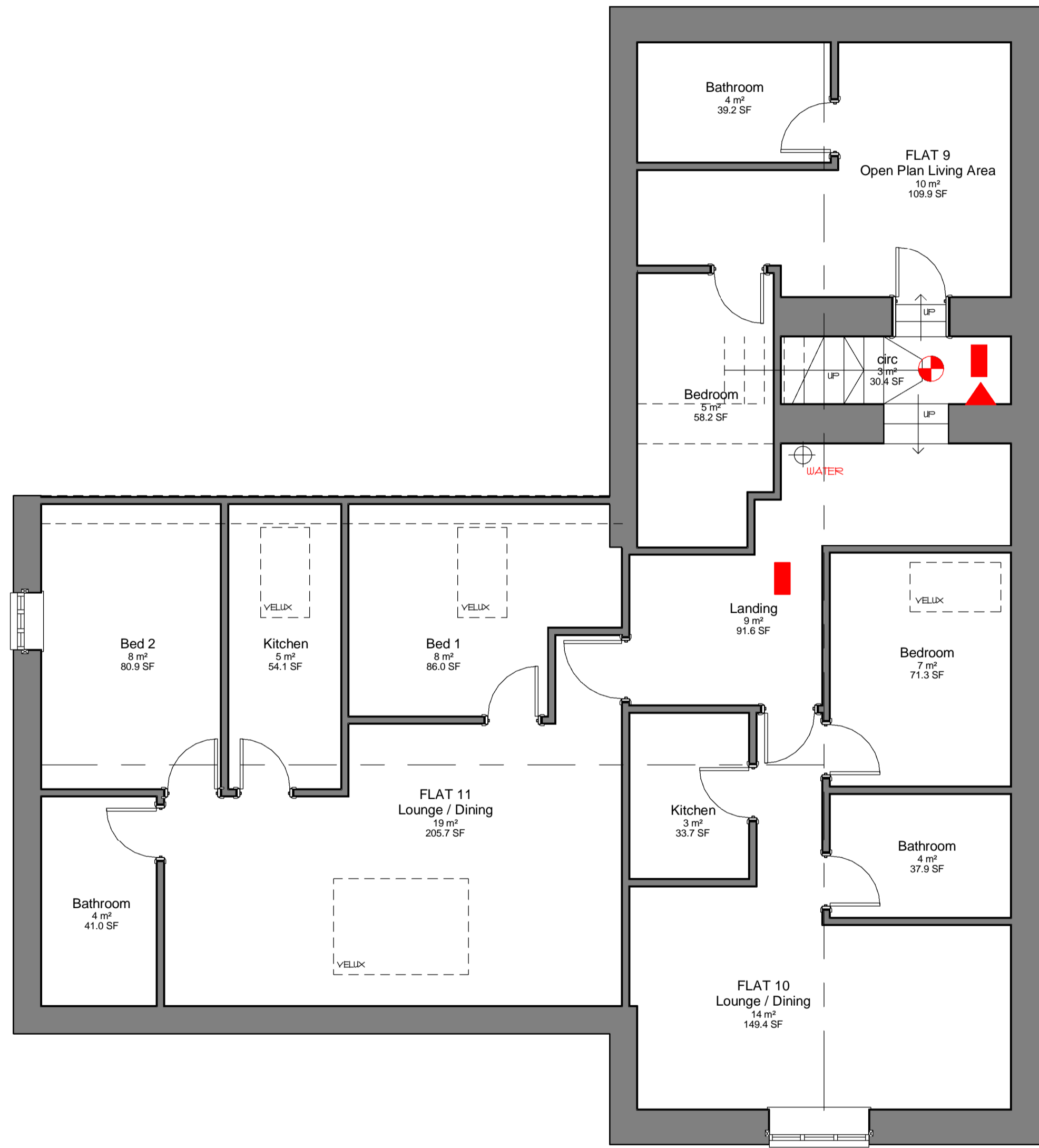
Second Floor 1 : 50